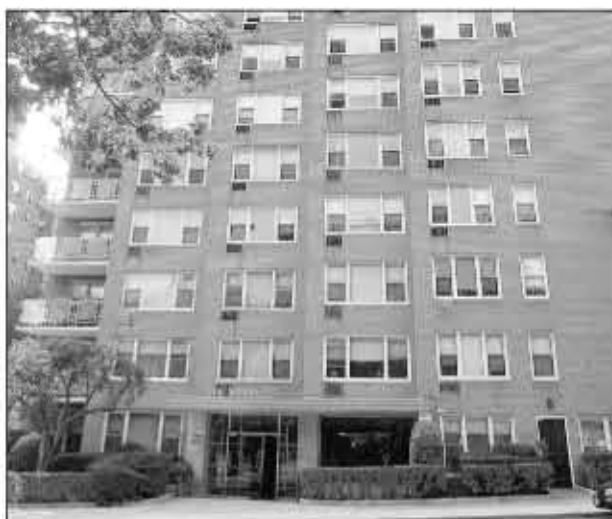
A TWO-BEDROOM co-op at 3255 Henry Hudson Pkwy. sold for $427,000 in August after six weeks on the market. It was $23,000 below the asking price.