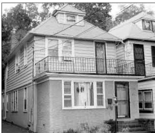
A THREE-BEDROOM house at 5661 Post Road sold for $595,000 last March after one month on the market. It was $34,000 below the asking price.