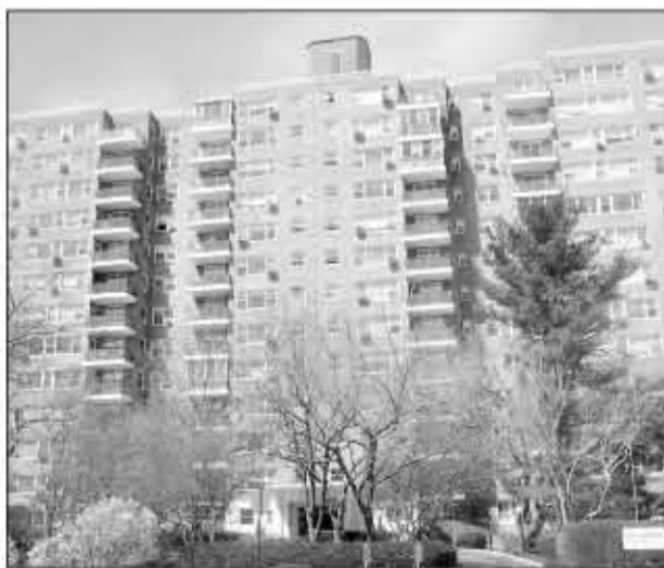
A TWO-BEDROOM co-op in the Glen Briar at 750 Kappock St. sold for $475,000 in July after six months on the market. It was $24,500 below the asking price.