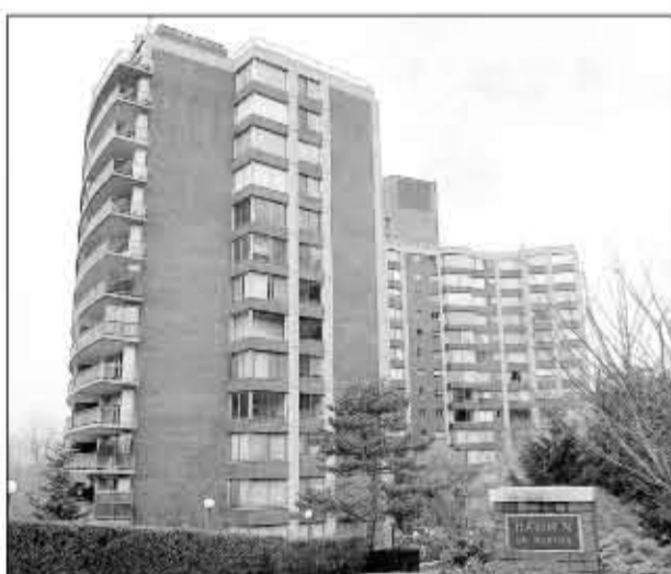
A TWO-BEDROOM condo at 4465 Douglas Ave. sold for $815,000 last June after seven months on the market. It was $20,000 above the asking price.