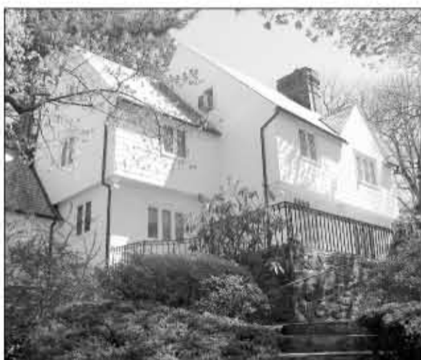
A HOUSE at 4720 Delafield Ave. sold for $1,875,000 in August 2006, after one month on the market. It was $120,000 below the asking price.